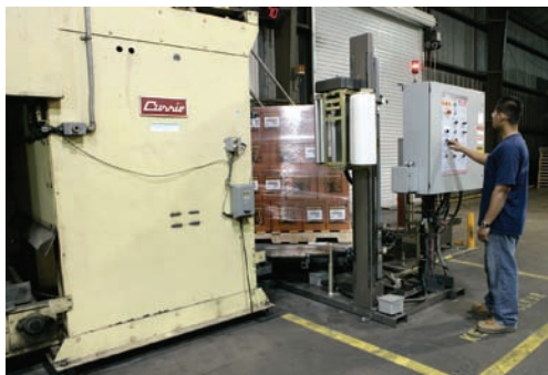
High level Currie palletizer mated with an Orion FA Series automatic stretchwrapper

Operation of a semi automatic stretch wrapper requires additional labor by the lift truck operator. Automatic wrapping frees up lift truck operators for other operations.