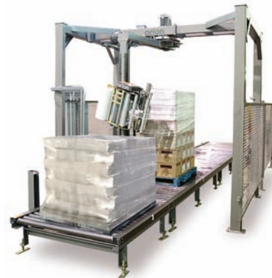
Orion rotary tower automatic stretchwrapper