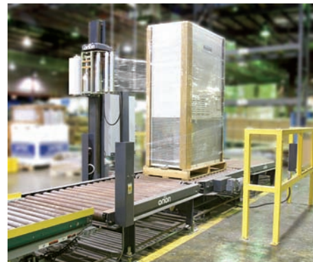
Orion turntable automatic stretchwrapper