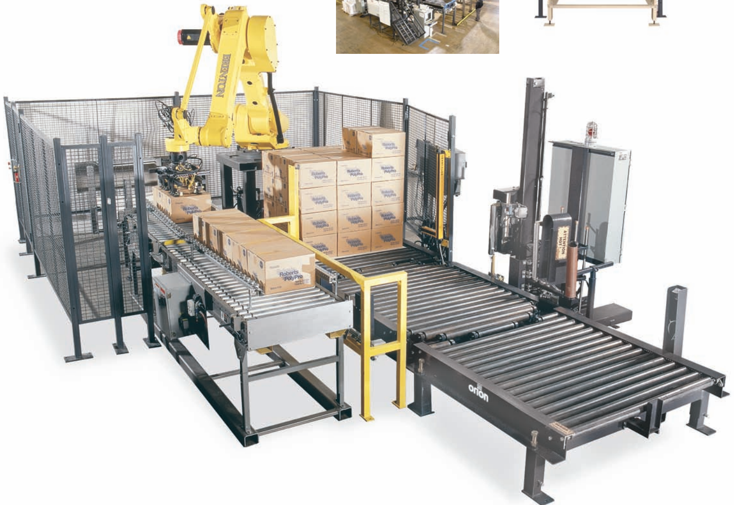
Brenton Robotic Palletizer Orion Automatic Turntable Stretch Wrapping System