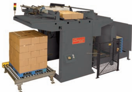
Currie by Brenton high level palletizer